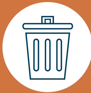
Throw out rubbish