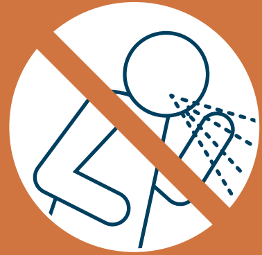
Don't handle food if sick