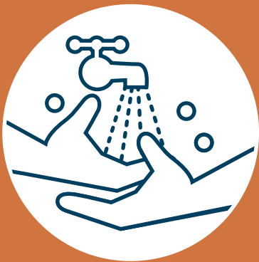
Wash your hands