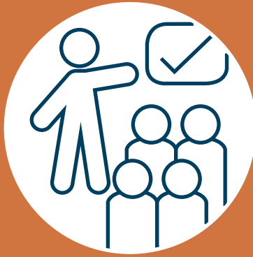
Train your staff